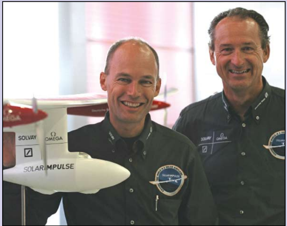
Bertrand Piccard and Andre Borschberg

main challenge is the energetic density of the batteries. Their stocking capacity is still limited and their influence has a great bearing on the total mass of the airplane. By doubling their storage capacity, it would be possible to allow a second person on board and therefore carry out longer flights.